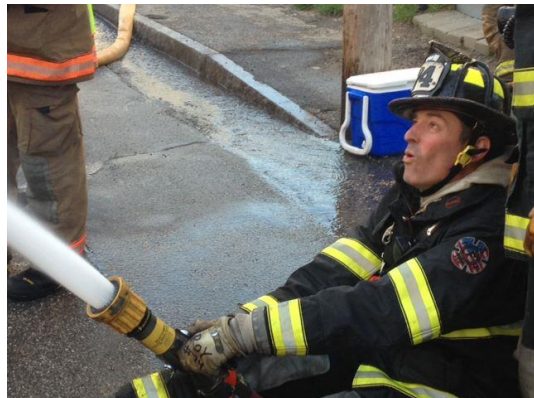
IAFF Local 797