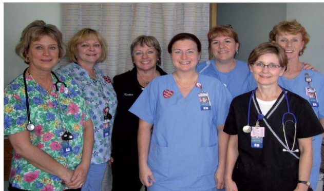
Maine State Nurses Association Unit 1