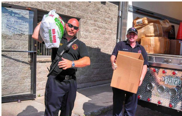
Teamsters Local 340